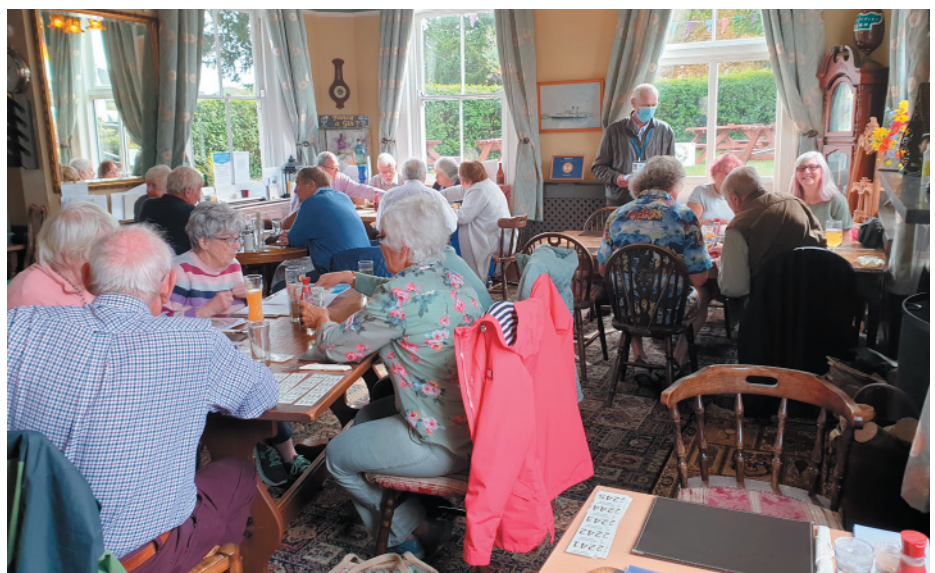
Eyes down for the raffle at the Waverley Inn

Text or phone your answers to 07568245124 or email at iwpcsg@gmail.com by 20th November.