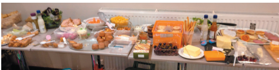
Top picture: Displays on the wall. Lower: food on the table