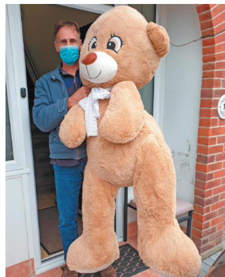
Teddy leaves for new home