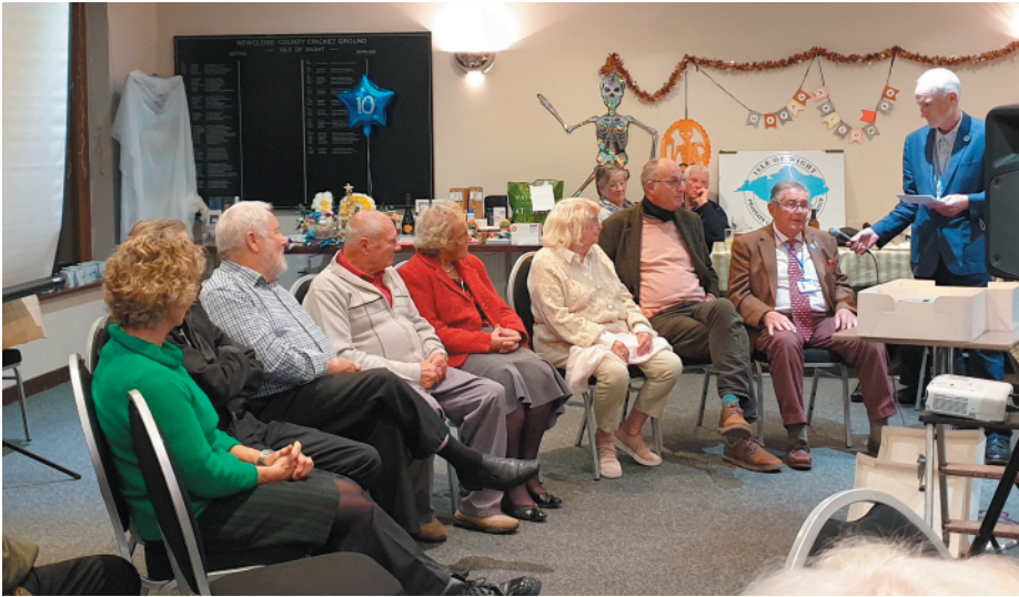
Founder members are interviewed